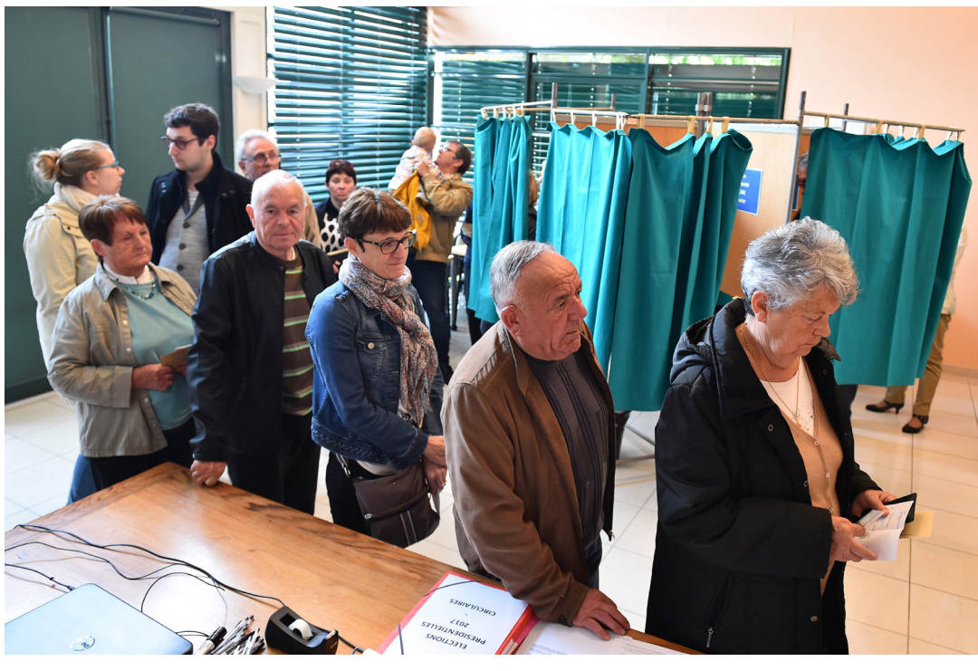
Polling station during the second round of the French presidential election.

Lesson 6: Put Pressure on Digital Platforms. Ten days before the vote, Facebook announced that it "[had taken] action against over 30,000 fake accounts" in France. It was later revealed that the actual number of suspended French Facebook accounts was actually 70,000.<sup>8</sup> Facebook had never taken such a drastic measure before but it responded to growing pressure by both states and the public to take decisive steps as digital platforms are the principal medium for the spread of disinformation.